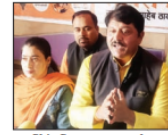
Shiv Sena accuses the Central for step-motherly treatment with J&K PAGE 3